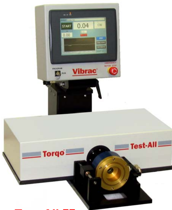
Test-All II Horizontal