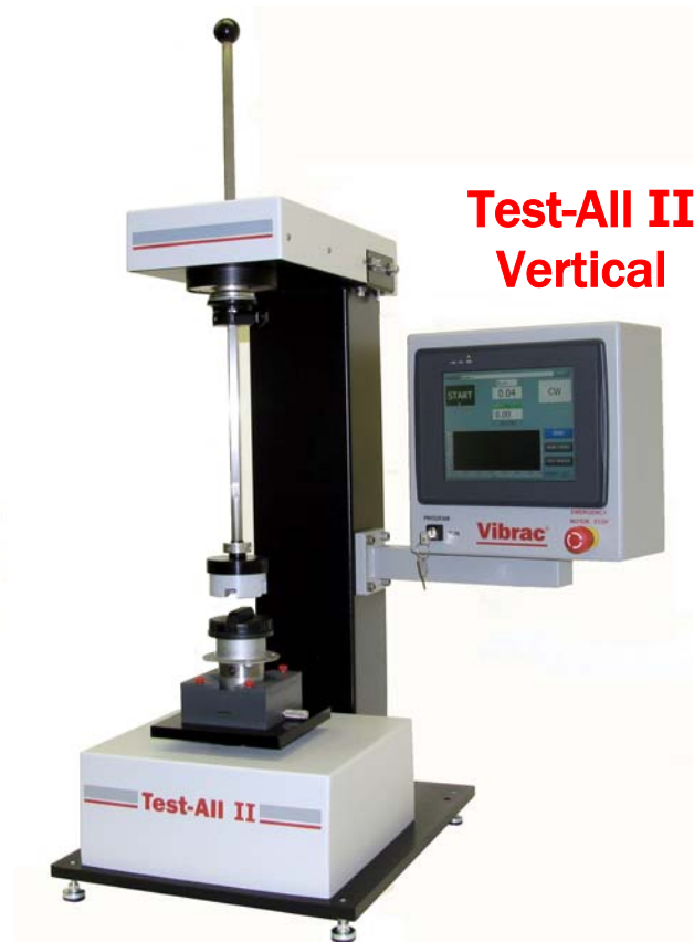
Test-All II Vertical